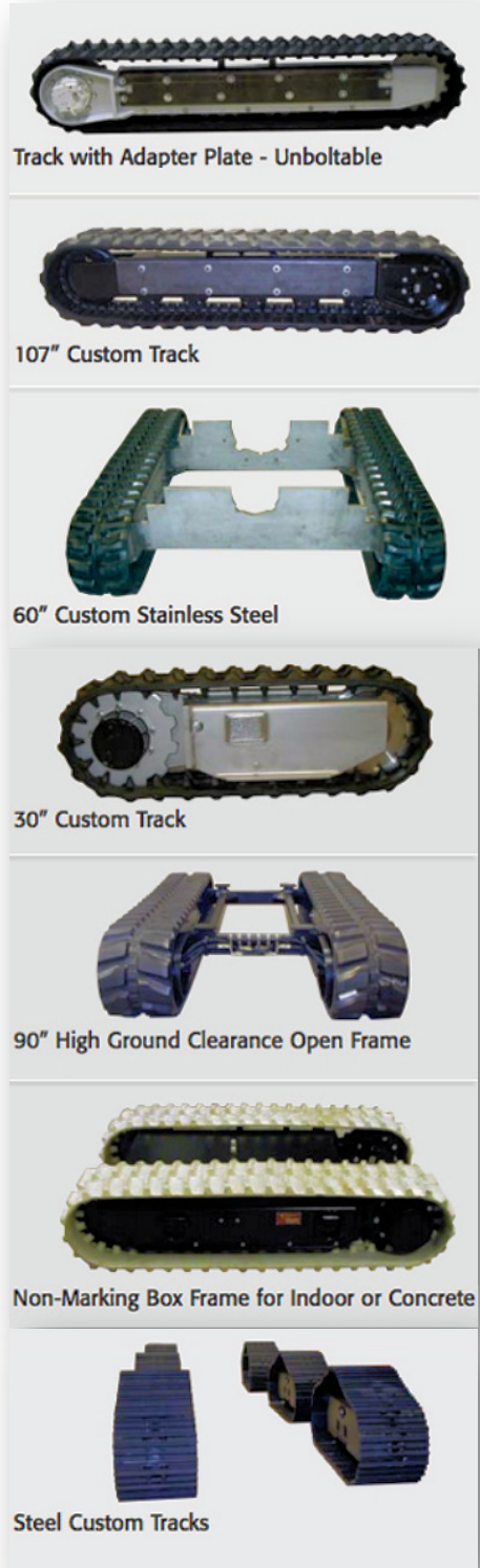
Track with Adapter Plate - Unboltable