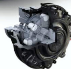
Radial piston hydraulic motor