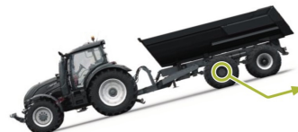
Reversing on steep hills