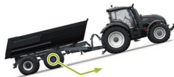
Driving up steep hills

The CTR201 control systems utilizes the tractor's ISOBUS, simplifying the operator's work significantly and offering unbeatable practicality. ISOBUS provides the system with all the data needed to control the trailer's wheel motors, such as the tractor's direction and speed. The display makes it easy to select the desired drive power, after which the trailer automatically pulls in the same direction and at the same speed as the tractor. When accelerating, the operator does not have to disengage drive, as the system automatically does so at high speeds. If required, the operator can also disengage the automatic system and control the trailer's drive manually.