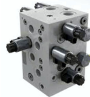
Valve 2WD / 4WD

Tractive Power Always When Needed Freewheeled Without Active Hydraulics